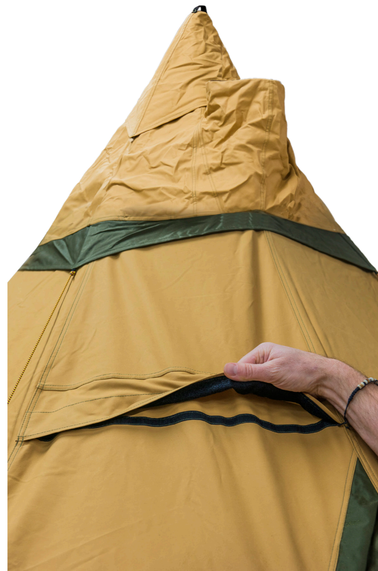
The accessory sleeve is standard on all Safir and Zirkon up to size 9 since 2012 and all Olivin since 2016.

You would only need an accessory connector to use an accessory as a porch, a canopy or a rain roof if your tipi doesn't already have the accessory sleeve. The accessory sleeve is standard on all Safir and Zirkon up to size 9 since 2012 and all Olivin since 2016. Onyx and all tents in size 15 lack the accessory sleeve.