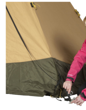
Peg the long bands to the ground.