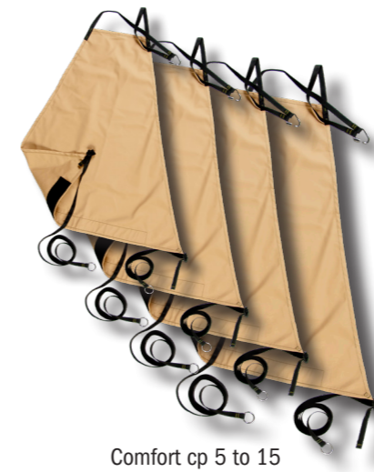
Comfort cp 5 to 15

The Accessory connector, formerly called the porch connector, is now available for all Nordic tipi sizes. Base light is available in size 7 and 9. Comfort light is available from size 2 to 9. Comfort cotton/polyester is available from size 5 to 15.