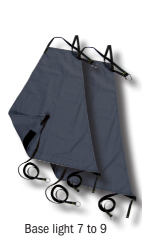
Base light 7 to 9