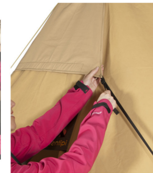
Tighten the bands, ensuring that the accessory connector is correctly and snugly positioned.